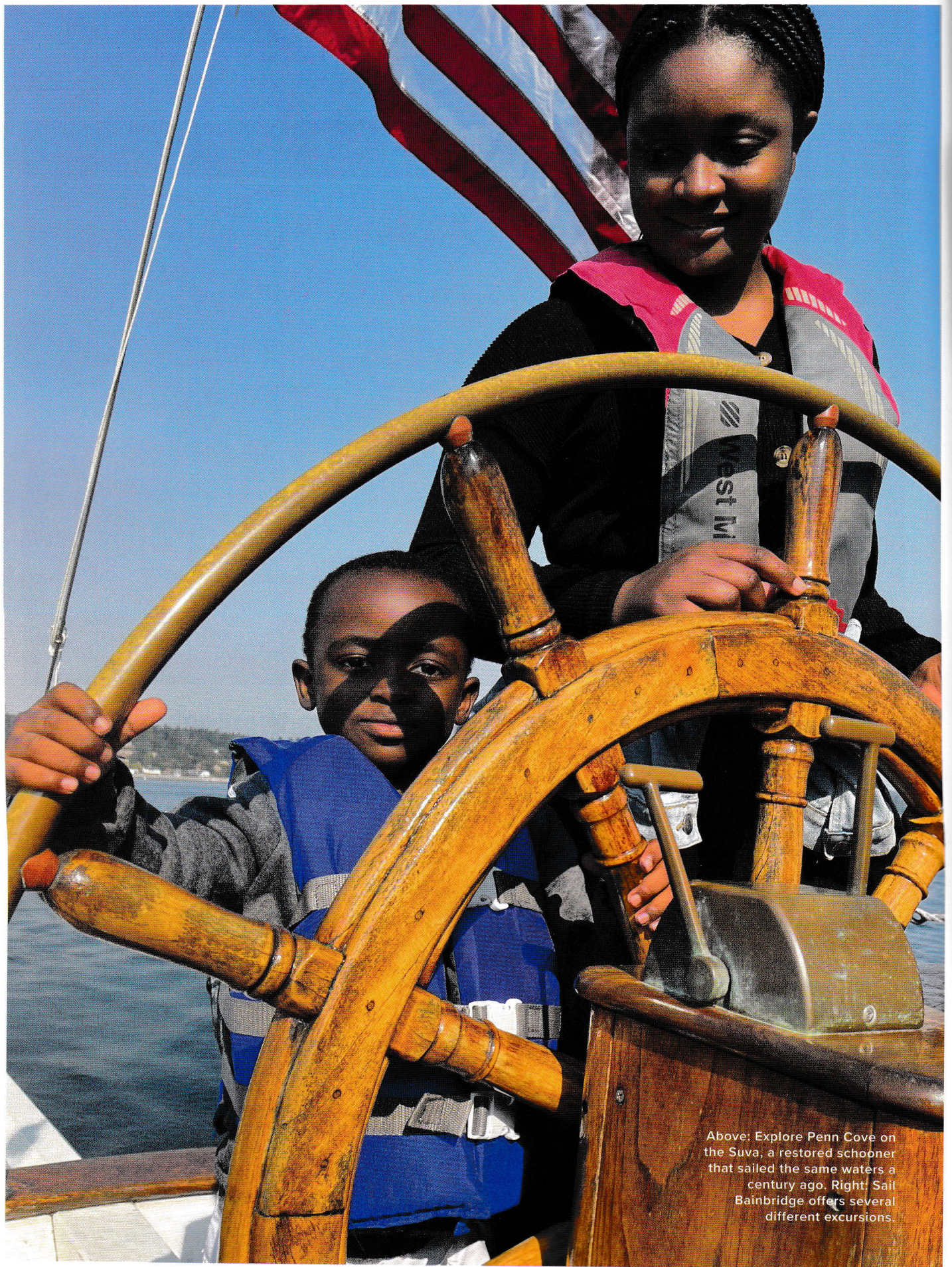
Above: Explore Penn Cove on the Suva, a restored schooner that sailed the same waters a century ago. Right: Sail Bainbridge offers several different excursions.